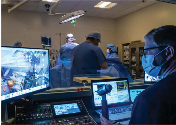
Simulation and imaging suites afford future surgical staff from the Nurse Anesthesia and Radiation Sciences programs to practice in realistic settings with the same equipment they will one day use to administer radiation to cancer patients.