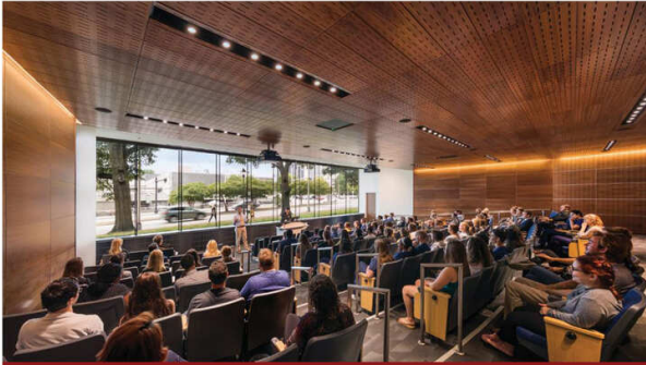
A large, glass-front auditorium is prominent on the College of Health Professions' first floor. Due to the height of the building and the resulting need for sound attenuation, the plumbing engineering team designed the gravity drainage systems using cast-iron piping with sound lagging.

engineers had to devise an alternative solution given the auditorium's location.