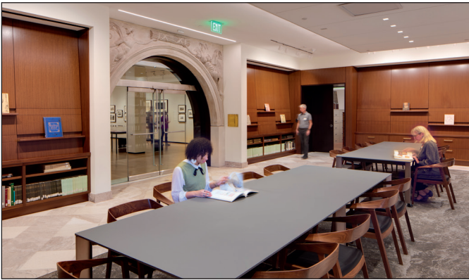
The Nancy Dorman and Stanley Mazaroff Center for the Study of Prints, Drawings and Photographs includes a preaction suppression system to protect its collection of works on paper.

below it. Extending the preaction system upward eliminates that cascading risk.